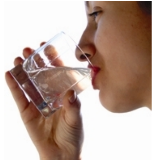
Water helps keep the body at optimum health.

Not only is water important for skin health, it can also play a key role in the prevention of disease. Drinking eight glasses of water a day can decrease the risk of colon cancer, bladder cancer, and potentially even breast cancer.