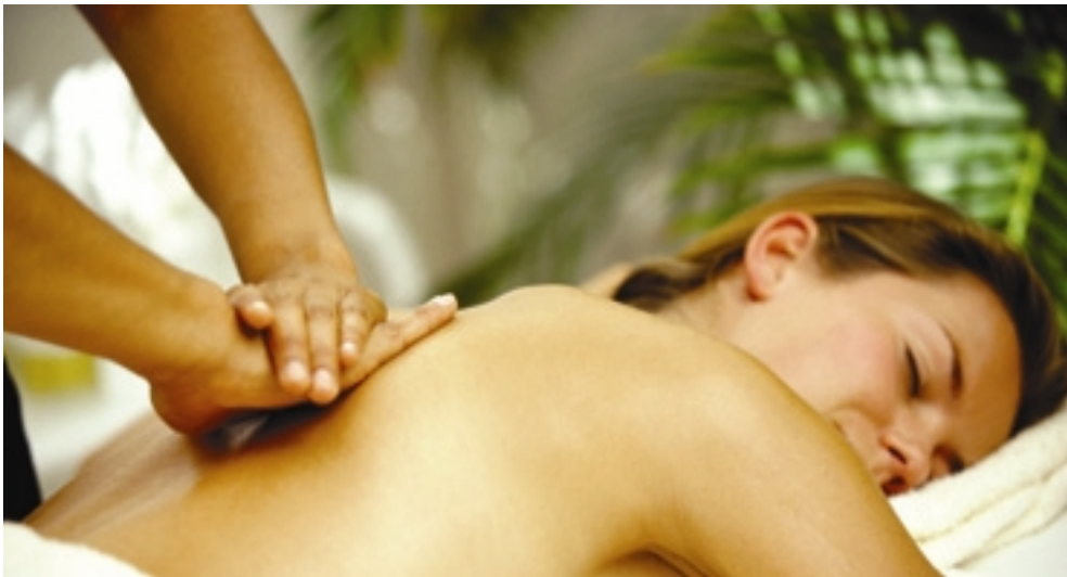
The more often you receive massage, the more therapeutic it becomes.

How often you receive massage depends on why you're seeking massage. In dealing with the general tension of everyday commutes, computer work, and time demands, a monthly massage may be enough to sustain you. On the other hand, if you're seeking massage for chronic pain, you may need regular treatments every week or two. Or if you're addressing an acute injury or dealing with high levels of stress, you may need more frequent sessions. Your situation will dictate the optimum time between treatments, and your practitioner will work with you to determine the best course of action.